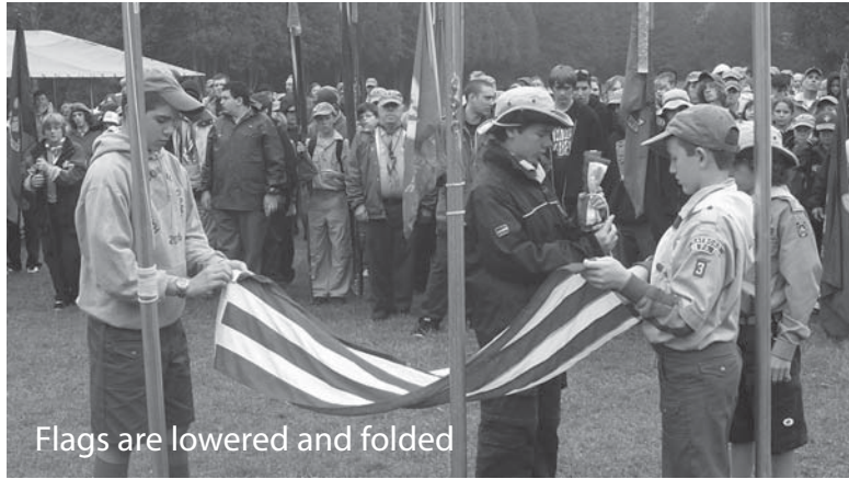
Flags are lowered and folded