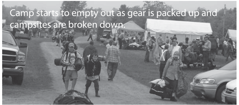
Camp starts to empty out as gear is packed up and campsites are broken down.