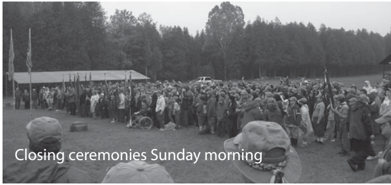
Closing ceremonies Sunday morning