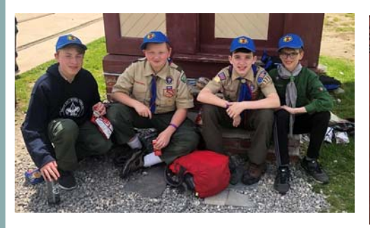
Enjoying the lunch break at the Roundhouse Train Museum