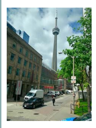
There is nothing like being greeted with the awesome sight of the CN Tower upon disembarking from the buses.